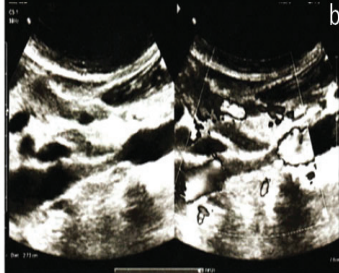
[Table/Fig-1]: (a) Ultrasound image in the midsagittal section shows the level of luminal stenosis (arrow) and the area of hypoplasia. (b) Colour Doppler image showing no colour uptake at the level of stenosis.